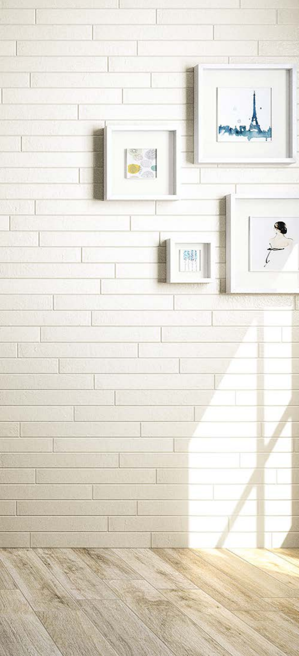
Ivory 6,5x50,2 pav. Focus Cinder 16x99,5